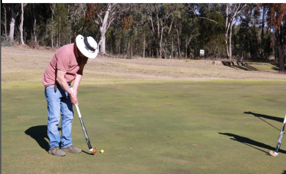
Greenkeeper Challengers Hockey sticks, tractors and utes